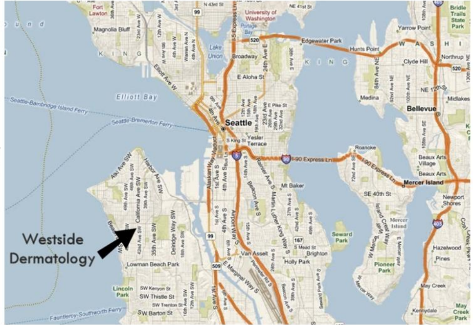
Regional Map & West Seattle

Park in the free parking area next to the clinic.